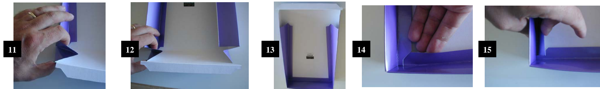
Photo 11,12 = Crease corner joint, then fold box side over and down to form end (see photo 13) Photo 14, 15 = Use locking tabs to secure the box Repeat these two steps for opposite box end ASSEMBLE LID USING SAME METHOD