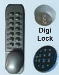
MKP Digi Lock Audit