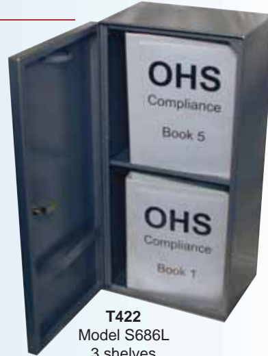
T422 Model S686L 3 shelves (shown with 1 shelf)