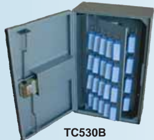
TC530B Model C530/80 (Audit Safe Lock shown)