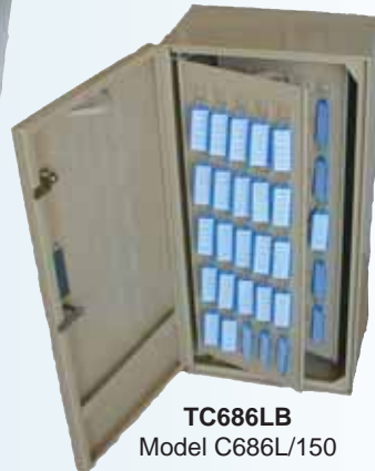
TC686LB Model C686L/150