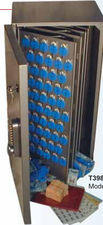
T398HGM Model 686L/450 (MKP shown)