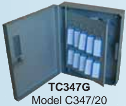
TC347G Model C347/20