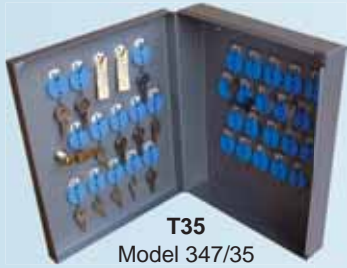
T35 Model 347/35