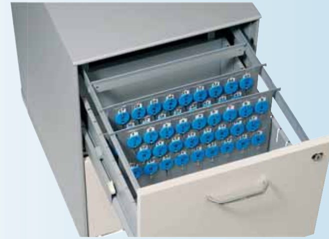
T200G50 Suspension 50