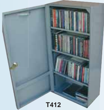
T412 Model S686 3 shelves