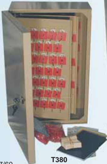
T380 Model 530/175