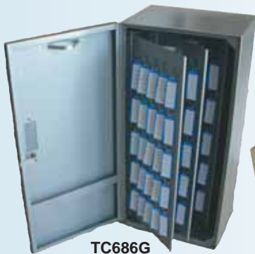
TC686G Model C686/100