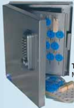
T376M Model 347/60 (MKP shown)