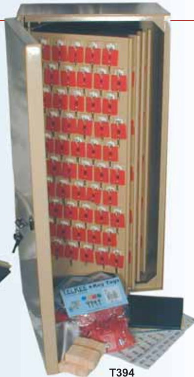
T394 Model 686/350