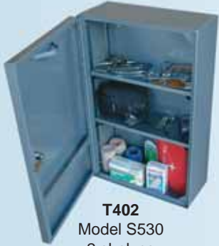
T402 Model S530 2 shelves